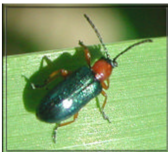
FIGURE 1. ADULT CLB.