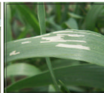
FIGURE 6. CLB LARVAL FEEDING.

Larva — The larva has a light yellow body with brown head and legs. They have three pairs of legs located close to the head end. The body is protected by a layer of slimy fecal material which makes them look like a slug. When working or walking in an infested field the slimy covering will rub off on your clothing. Although both adults and larvae cause feeding damage, the larvae are responsible for the majority of the damage. They feed on the leaf surface between veins, removing all the green material down to the lower cuticle, resulting in an elongated windowpane in the leaf. Severe feeding damage gives the field a frosted appearance.