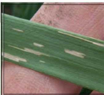
FIGURE 2. ADULT FEEDING DAMAGE.

Adult — ¼ inch long with brightly colored orange-red thorax, yellow legs and metallic blue head and wing covers.