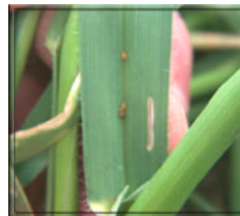
FIGURE 3. CLB EGGS ON WHEAT LEAF.

Damage — The first sign of CLB activity in the spring is adult feeding damage on the plant foliage. Adult injury is characterized by elongated, slender slits in the upper leaf surface.