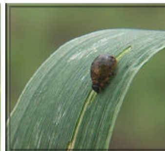
FIGURE 5. CLB LARVA - WITH SLIMY, BLACK COATING.