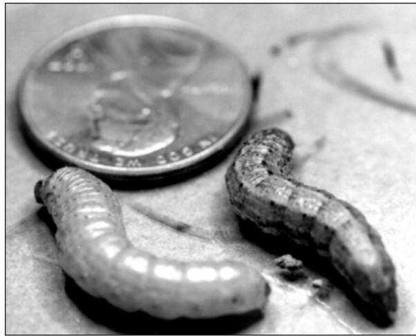
FIGURE 1. A pale western cutworm (left) and an army cutworm are shown with a penny.

and construct earthen cells in which they pupate. Adult moths, also known as millers, emerge from these cells in May and early June. An interesting phenomenon with this cutworm species is its seasonal migration to high elevations in the Rocky Mountains. Adult moths are active at night at these higher elevations, feeding on alpine flower nectar. During the day they form dense aggregations under stumps, logs and other structures that offer them protection from direct sunlight. Wildlife researchers report that these dense aggregations of cutworm moths are an important food source for grizzly bears in the absence of high-quality forage alternatives in July and August. Adult moths return to the plains in